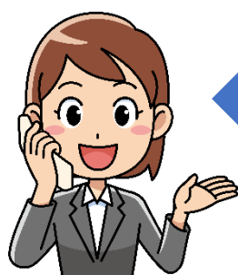
Call Center (Interpreter)

Opening hours: 24 hours (including Saturdays, Sundays and national holidays)